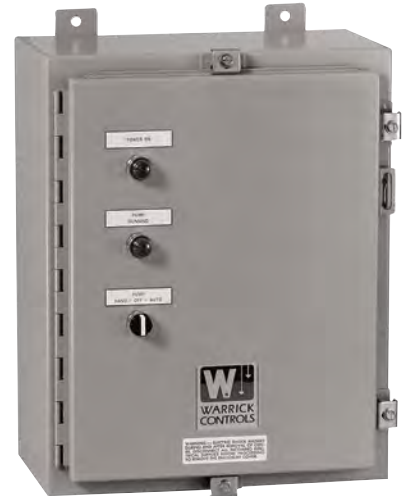
Single-function standard panel

When it comes to control panels, Gems Sensors can satisfy most requirements with our new family of CP Series Panels. These standard models were specifically designed around our most popular panel types. These industrial control panels interface with level and flow switches, Warrick conductance probes and a variety of sensors and are factory set for pump up/pump down. Gems can provide the panel and sensors you need for intrinsically safe and non-intrinsically safe environments. With each control panel, Gems provides electrical and mechanical drawings along with installation and operations manuals.