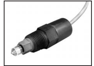
GLL110020 shown with Quartz tip