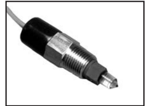
GLL110021 shown with Quartz tip