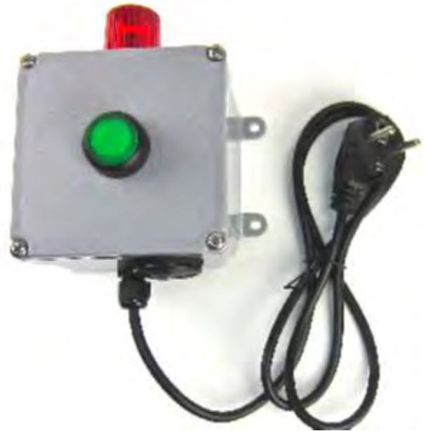
POWER FAIL ALARM MODEL PFA-5