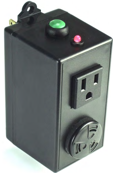
POWER FAIL ALARM MODEL PFA-1