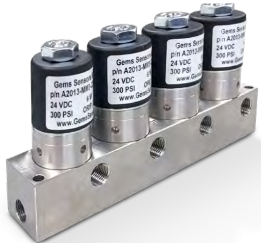
4-Port Return 303 SS manifold. Pictured with Gems manifold mount solenoid valves—sold separately. Select from Gems A Series or B Series for use with these manifolds.