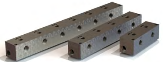
303 SS manifolds are available with either Supply or Return functionality in 2-, 4-, or 6-Port configurations.