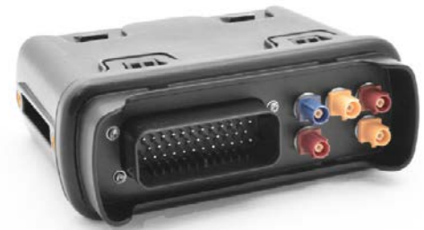
Gems Sensors Fluid Condition Gateway

Gems Fluid Condition Monitoring System can be customized across multiple applications