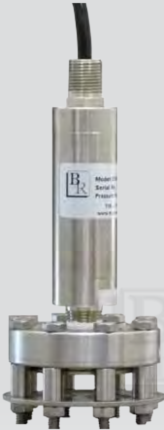
Model BC001 Birdcage®