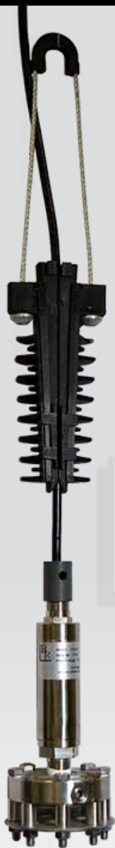
Model BCH2000 Cable Hanger

The Model BCH2000 Cable Hanger from Blue Ribbon Corporation is designed to eliminate unnecessary stresses on the transmitter while installed in the application. Affordably priced, the BCH2000 Cable Hanger is designed for easy installation within a variety of environments.