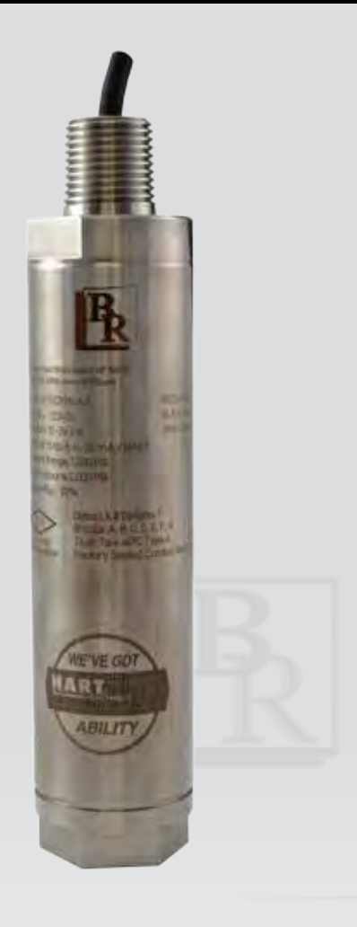
Model BR411, 411XP Smart Rangeable Pressure Transmitter