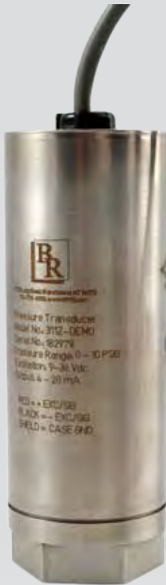
Model 311 Z, I, GI, AI Intrinsically Safe Pressure Transducer

The GP:50 Model 311Z, I, GI, AI intrinsically safe pressure transducer for Blue Ribbon Corporation offers a rugged solution in hazardous approved areas. The transducer's all-welded stainless steel design provides years of reliable service in some of the harshest applications.