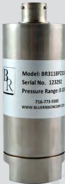
Model BR111 / BR211 / BR311 Industrial Grade Pressure Transducer