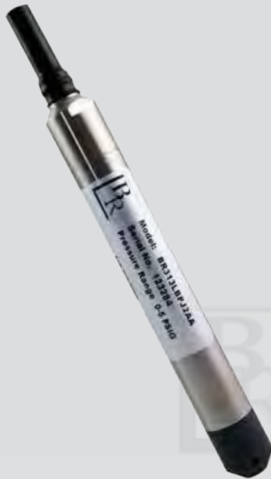
Model BR313L Submersible Level Transmitter