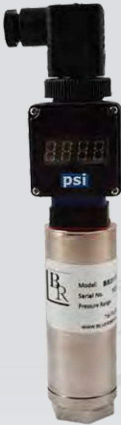
Model LD1001 Loop Powered Local Indicator