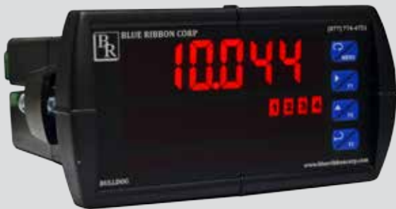
Models BD300 Pump Controller

The Model BD300 Pump Controller is designed exclusively for use with the Blue Ribbon Birdcage® submersible level transmitter to provide multiple pump alternation for pumping stations and water municipalities. Featuring four programmable relay switches, a large 6 digit LED dual display, AC or DC power input, and digital communication options, the BD300 is suited for the most demanding environments.