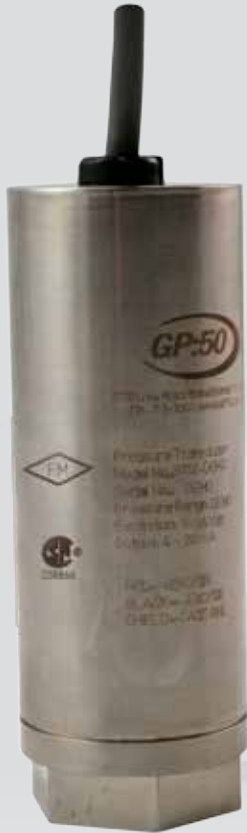
Model 311 Z, I, GI, AI Intrinsically Safe Pressure Transducer