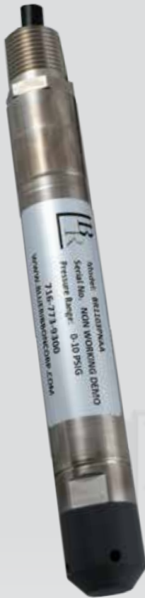
Model BR1102 / 1103 Low-Cost Submersible Level Transmitter