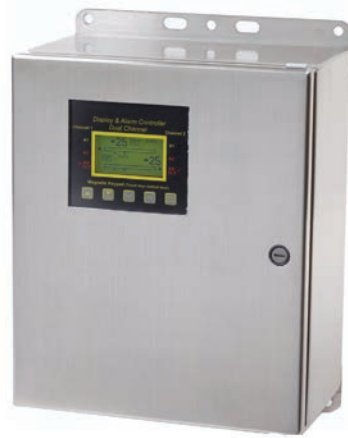
ST-90SSDUAL Stainless Steel 90-05