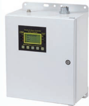
ST-90PCSQUAD Painted Carbon Steel 90-51

CSA certified for Division 2 potentially hazardous areas