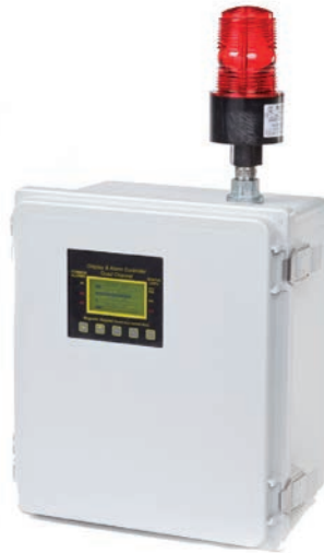
ST-90PYQUAD NEMA 4X Non-Metallic 90-50

The ST-90 Quad Channel Controller provides simultaneous display and alarm functions for four monitored variables. Easy to configure and user friendly, the ST-90 Quad can function as a critical alarm controller for toxic gases, combustible gases, vibration, tank levels and other process values.