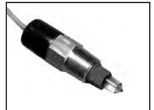
GLL110021 shown with Quartz tip