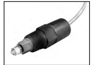
GLL110020 shown with Quartz tip