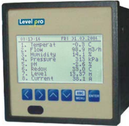
An example of what the display looks like