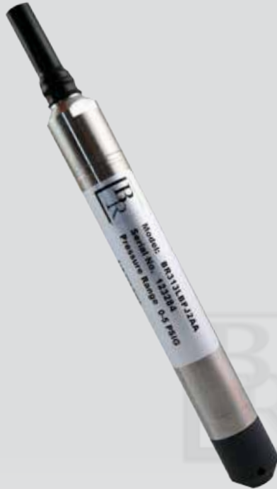
Model BR313L Submersible Level Transmitter