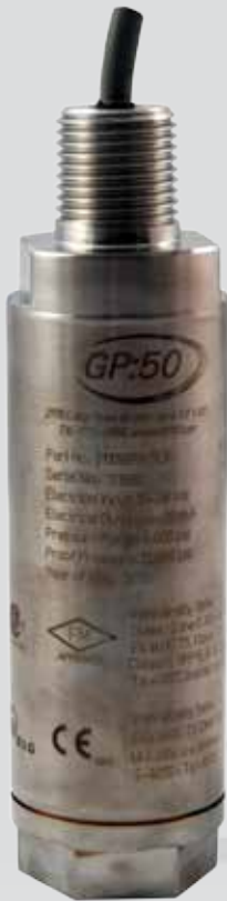
Models 111X/P, 211X/P, 311X/P & 311N/AN/GN Explosion Proof & Zone 2/Div 2 Pressure Transmitter