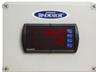
PRD1000 in NEMA 4X Enclosure

MSZ EN 60079-0:2013 MSZ EN 60079-0:2013/A11:2014 MSZ EN 60079-11:2012